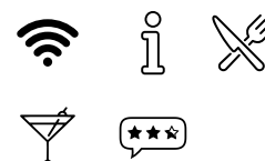
Available icon markings