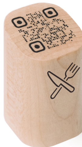
Porter mini shown with menu logo

Porter Mini makes sharing and interacting with guests effortless. The device caters to a variety of uses including serving menus, collecting feedback, facilitating reviews, and even sharing Wi-Fi networks. It may be set up in minutes using an Android or iOS device. When a guest scans the QR code, your content is delivered seamlessly onto their phone. The device may be configured to load custom branding on the guest's phone and collect guest email addresses. You may also direct the customer to view additional offers or information that may be helpful during their visit.